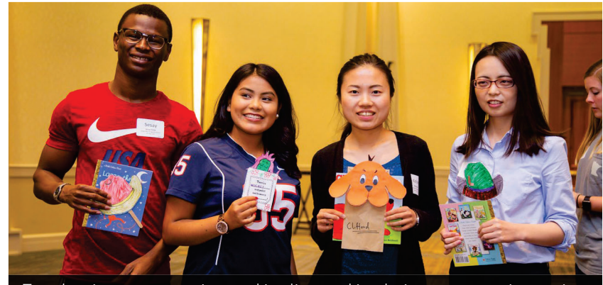
Travelers interns spent time making literacy kits during a community service event at the annual Intern Symposium in Hartford, Connecticut.